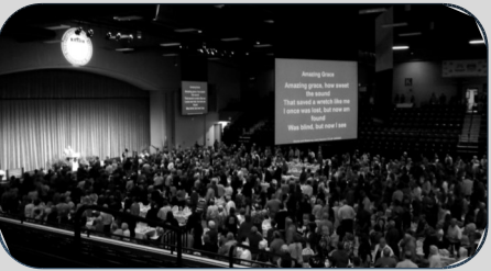
Right to Life of North Central Indiana set a new record of over 1,200 guests in 2015 in Winona Lake.