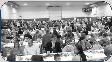
Over 600 guests attended the 2015 Daviess County Right to Life banquet just outside of Montgomery.