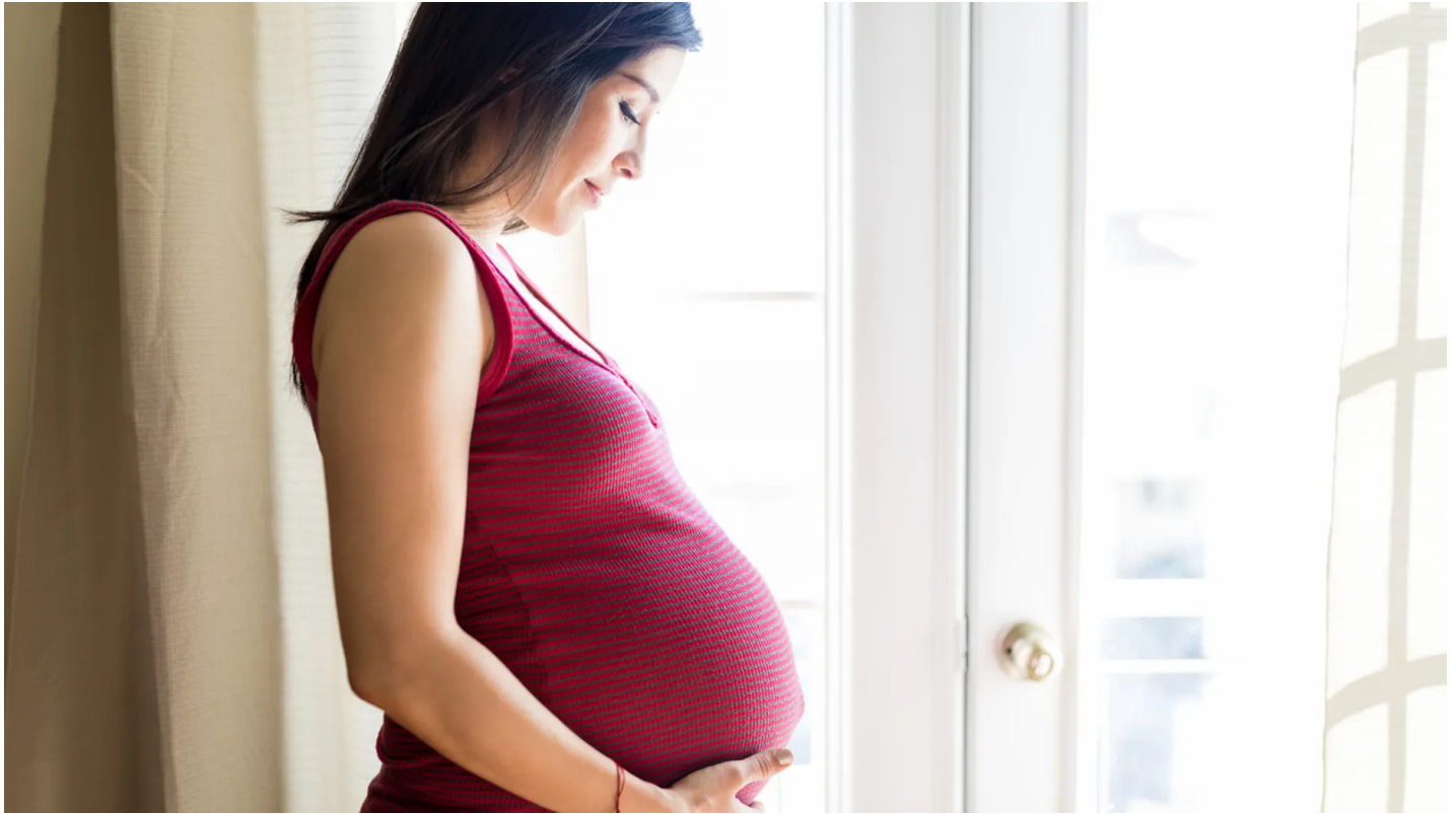
A pregnant woman shown here is close to giving birth to her baby.

"The first and most important thing [the counselors] do is listen," he said. "Listen and meet her where she is — ask her what the stressors are, what her pressures are — and then we help her help herself."