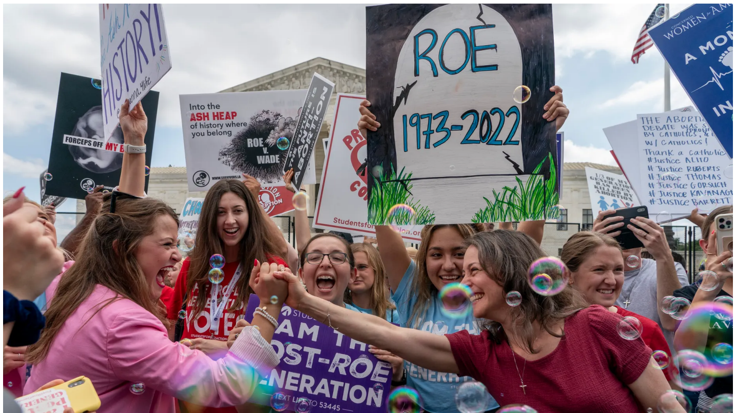
Pro-life women celebrate following the Supreme Court's decision to overturn Roe v. Wade and send the issue of abortion back to the states, outside the Supreme Court in Washington, D.C., on Friday, June 24, 2022.